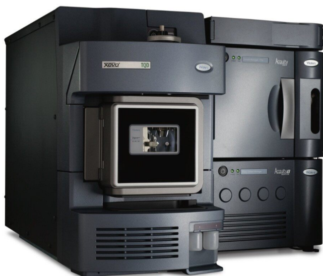
Figure 1. Waters ACQUITY UPLC I-Class System with Xevo TQD Mass Spectrometer.

The data presented indicates the ACQUITY UPLC I-Class (FTN) with Xevo TQD is capable of meeting the analytical precision necessary for measurement of physiologically-relevant concentrations of serum 17-OHP for clinical research. The narrow diameter tubing of the ACQUITY UPLC I-Class System creates a low-dispersion system allowing for greater LC peak capacity and precision than achieved before with the ACQUITY UPLC System . The inclusion of active pre-column heating of mobile phase brings further advantages in terms of column efficiency, improving reproducibility of peak area integration. Precision at low concentrations contributes to overall analytical sensitivity (Table 2). With further optimization of LC methods to improve detection of A4, this configuration can be used in laboratories with low to moderate detector sensitivity needs.