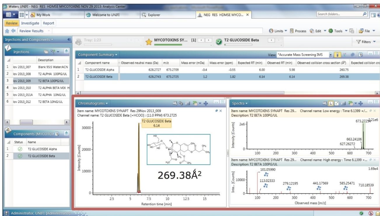
Figure 2. UNIFI Software screenshot showing CCS value for a masked mycotoxin compound T2 \beta -glucoside together with the corresponding exact mass precursor ion and ion mobility product ion spectra.

The use of CCS measurements in parallel with traditional parameters such as exact mass can increase targeted and non-targeted screening specificity. CCS values can be added into a Scientific Library within UNIFI and integrated into a routine screening workflow to allow them to be utilized to screen and confirm the presence of food and environmental contaminants, nutrients, flavor compounds, or any other molecules of interest. By utilizing CCS as an additional 'data filter' can also help to remove false positive and most importantly false negative identifications. Measurement and use of CCS values can also aid method development by reducing the burden of costly retention time confirmation using expensive standards for compounds where the CCS value has previously been determined.