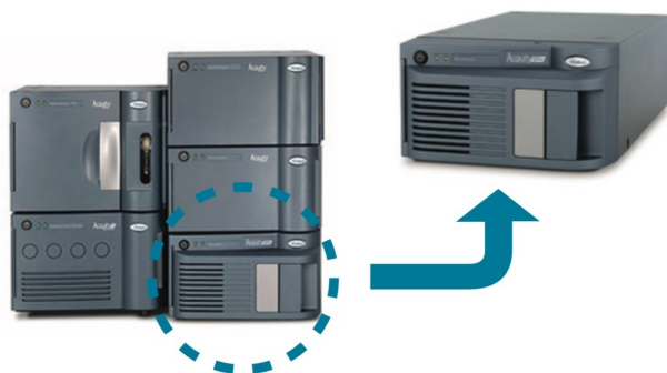
Figure 1. The ACQUITY QDa Detector. The compact footprint of the ACQUITY QDa allows for easy integration into existing instrument stacks. Its plug-and-play design allows for the implementation of complementary orthogonal detection techniques with minimal effort into a single integrated system and workflow.

The ACQUITY QDa Detector offers the ability to combine straightforward mass spectral data with optical data in a single workflow with minimal effort and cost. The ACQUITY QDa is pre-optimized to work without the need for sample-specific user adjustments that are typical of traditional mass spectrometers, making it simple and easy to use. With a purposeful design that allows for integration into existing UPLC instrumentation (Figure 1), the ACQUITY QDa Detector is well-suited for improving productivity and strengthening quality assurance in the biotherapeutic production environment.