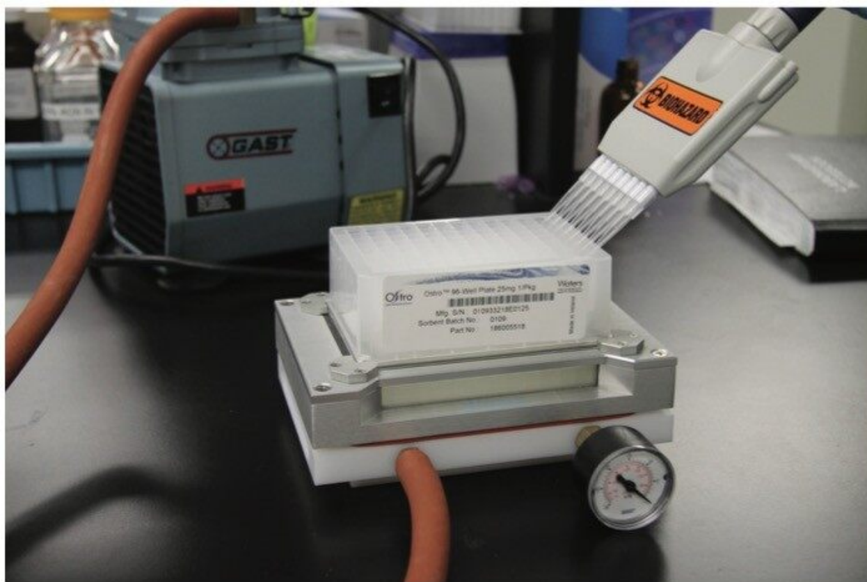
Figure 1. Typical setup for Ostro Pass-through Plate for analysis of milk.