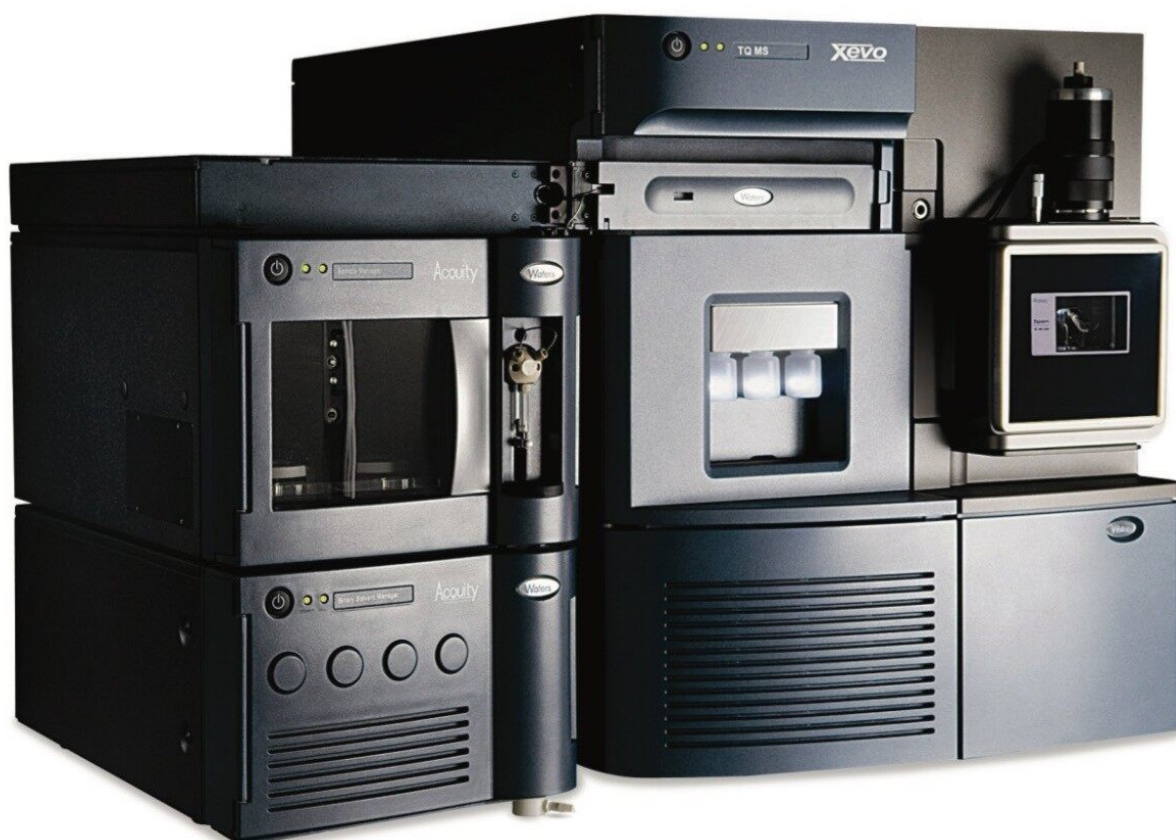
Figure 1. ACQUITY UPLC and Xevo TQ MS Detector.