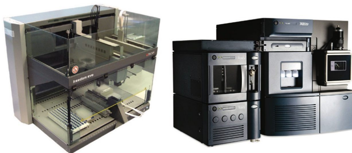
Figure 1. Tecan Freedom EVO 100 and the Waters ACQUITY UPLC Xevo TQ MS Detector