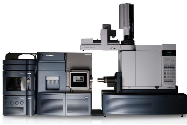
APGC with Xevo TQ-S

Figure 1 shows a typical calibration curve and residuals plot for azinphos methyl generated from the triplicate injection of each matrix matched calibration standard in strawberry extract. The response is linear from 0.05 to 50 ng/mL with a correlation coefficient R^2 of 0.997. All of the residuals are less than 20% demonstrating excellent linearity and repeatability of the APGC System. The limits of detection and linearity achieved for all 20 pesticides using the APGC-Xevo TQ-S are summarized in Table 1. The limits of detection range from 0.01 to 0.5 ng/mL with excellent linearity R^2 > 0.99 for all 20 pesticides. Figure 2 illustrates representative examples of APGC-MS/MS chromatograms