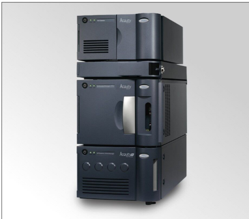
Figure 1. ACQUITY UPLC H-Class System with PDA Detector.

Figure 2 shows the separation of all dyes using the ACQUITY UPLC H-Class System with PDA Detector. The standard curves for all compounds were prepared over the concentration range of 2 to 40 \mu\text{g}/\text{mL} . Excellent linearities ( r^2 > 0.999 ) were achieved for all compounds. Example calibration curves for two of the compounds (P4R and brilliant black) are shown in Figure 3.