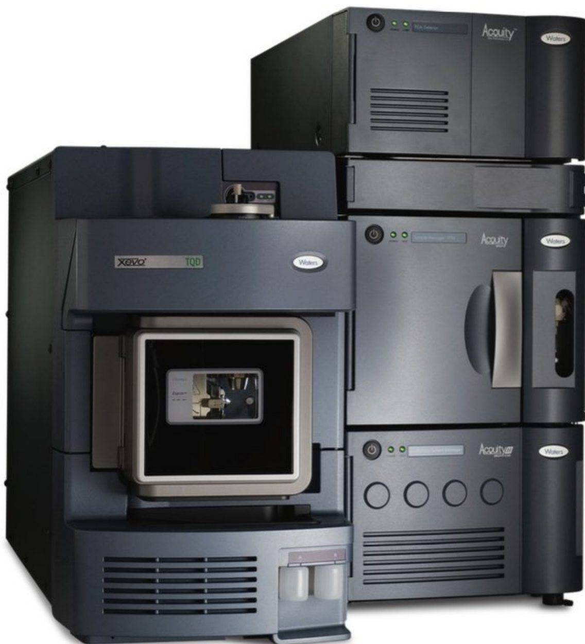
Figure 1. ACQUITY UPLC H-Class System with Xevo TQD.