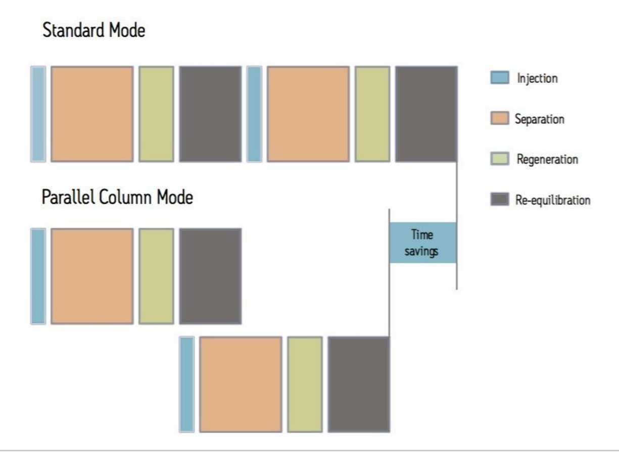
Figure 1. Comparison of the sequence of events between the standard 1D UPLC and parallel column regeneration UPLC.