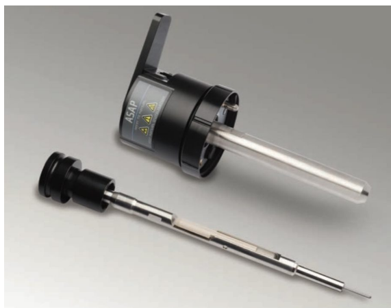
Figure 1. The Xevo Atmospheric Solids Analysis Probe (ASAP).