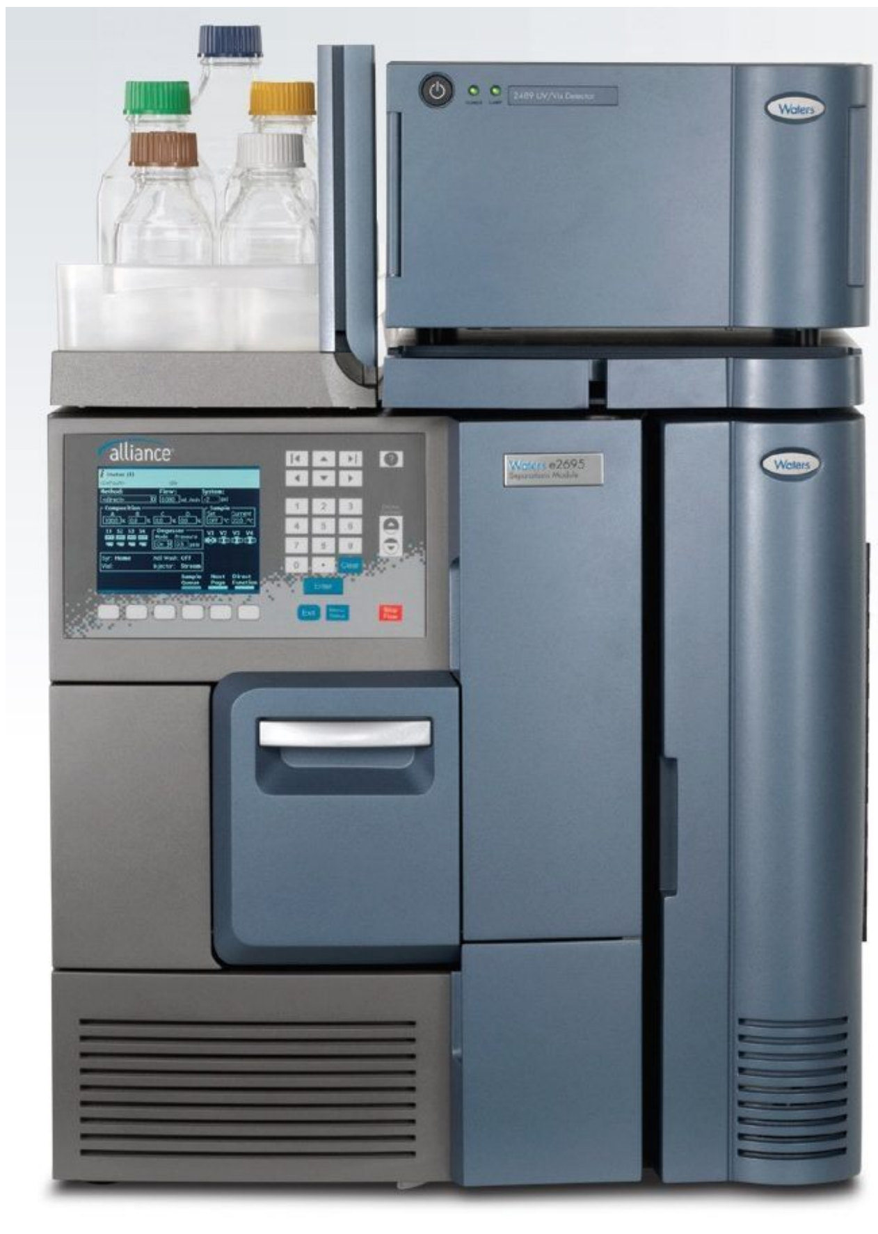
Figure 1. Alliance HPLC System with 2489 UV/Vis Detector.

The separation of the budesonide standard was run using the XBridge C 18 4.6 x 150 mm, 5 \mu