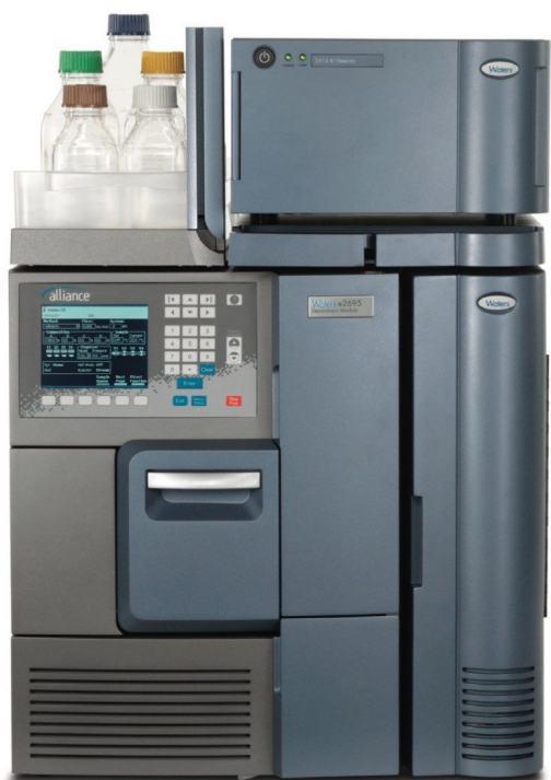
Figure 1. Alliance HPLC System with 2414 Refractive Index Detector.