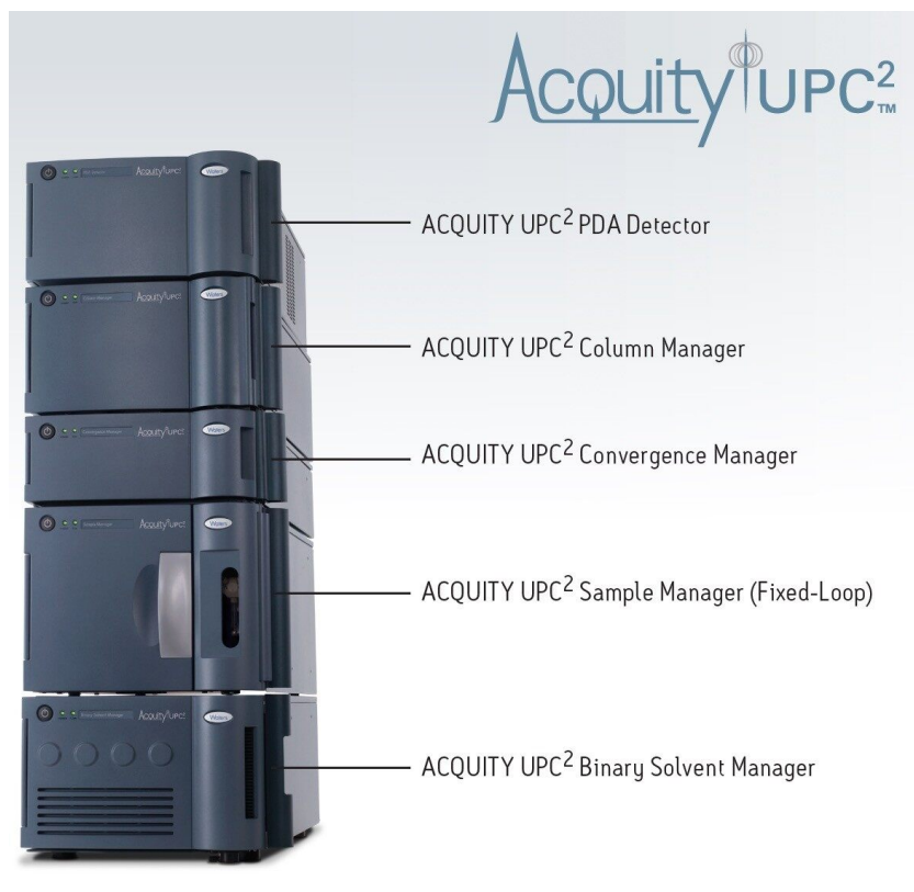
Figure 1. ACQUITY UPC 2 System.