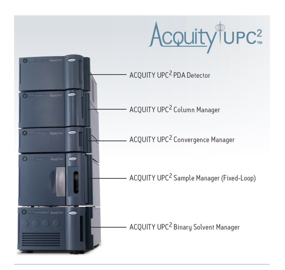
Figure 1. ACQUITY UPC<sup>2</sup> System.