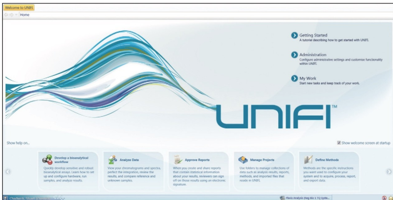
Figure 1. UNIFI Scientific Information System