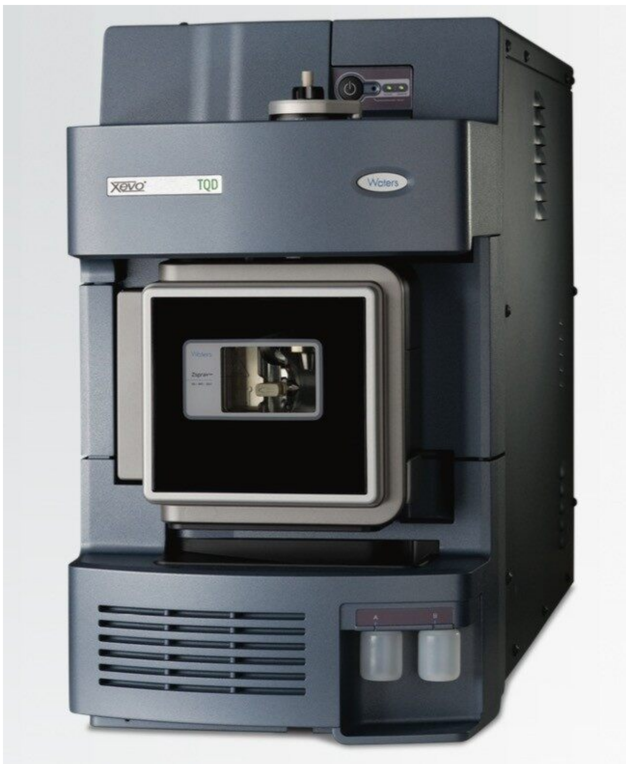
Xevo TQD System.