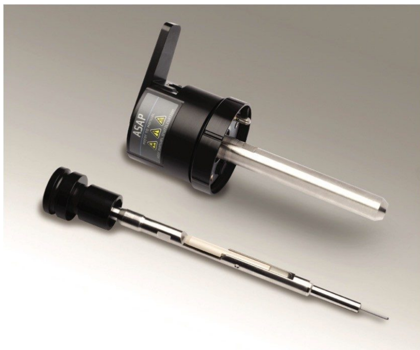
The Atmospheric Solids Analysis Probe (ASAP).