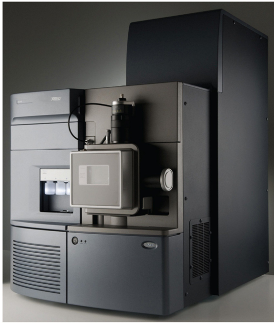
Figure 1. The Xevo QToF benchtop Mass Spectrometer.

Figure 2 shows the PLGS 2.4 processed MS E data file representing a 500 amol equimolar load of each protein in Mix 1. RMS mass errors of better than 3.5 ppm were achieved on all identified precursor ions of the four proteins. The aforementioned mass accuracies are independent of m/z range and scan time used, and are routinely achievable on a 35 cm flight tube. The ability to routinely obtain sub-5 ppm RMS mass accuracies on the precursor, in combination with high-mass accuracy fragment ion information, generated in the elevated LC/MS E scan, provides a high-degree of specificity and significantly reduces false positive identification rates.