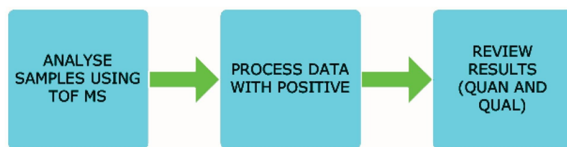
Figure 2. The Posi±ive workflow for processing TOF pesticide screening data.

During automated processing, pos performs a qualitative search to generate presence/absence results for the compounds in the target list, using mass accuracy and retention time to determine if compounds are positively, tentatively, or negatively detected. All positive and tentative detections are then automatically quantified and displayed within a TargetLynx™ browser report. Figure 3 displays the summary result for the Posi±ive-targeted and non-targeted screening of >100 pesticides in a batch of 11 sample extracts, with the calibration curves. Using Posi±ive only the positive (exact mass and retention time within definable tolerances) and tentative (retention time OK with flagging, indicating exact mass is out of tolerance) pesticides are automatically quantified, automating the highly time-consuming results review and compound list reduction process seen in the traditional workflow, as shown in Figure 1. Thiabendazole, which is highlighted in Figure 3, is one of the non-targeted compounds (with no calibration standard) which would not have been detected using the targeted approach reported in Figure 1.