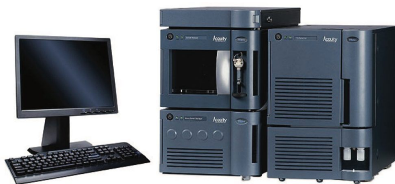
Figure 5. ACQUITY UPLC System with ACQUITY TQD Mass Spectrometer.

This solution provides an ideal basis for a streamlined approach to water-soluble vitamin analysis as it removes the need for multiple methods and offers the analyst the ability to analyze all B-complex vitamins and vitamin C in one rapid and simple procedure.