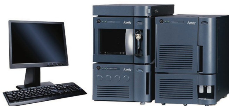
Figure 5. ACQUITY UPLC System with ACQUITY TQD Mass Spectrometer.

This solution provides an ideal basis for a streamlined approach to water-soluble vitamin analysis as it removes the need for multiple methods and offers the analyst the ability to analyze all B-complex vitamins and vitamin C in one rapid and simple procedure.