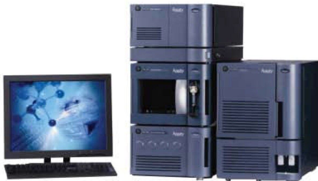
Figure 1. Waters ACQUITY TQD System.