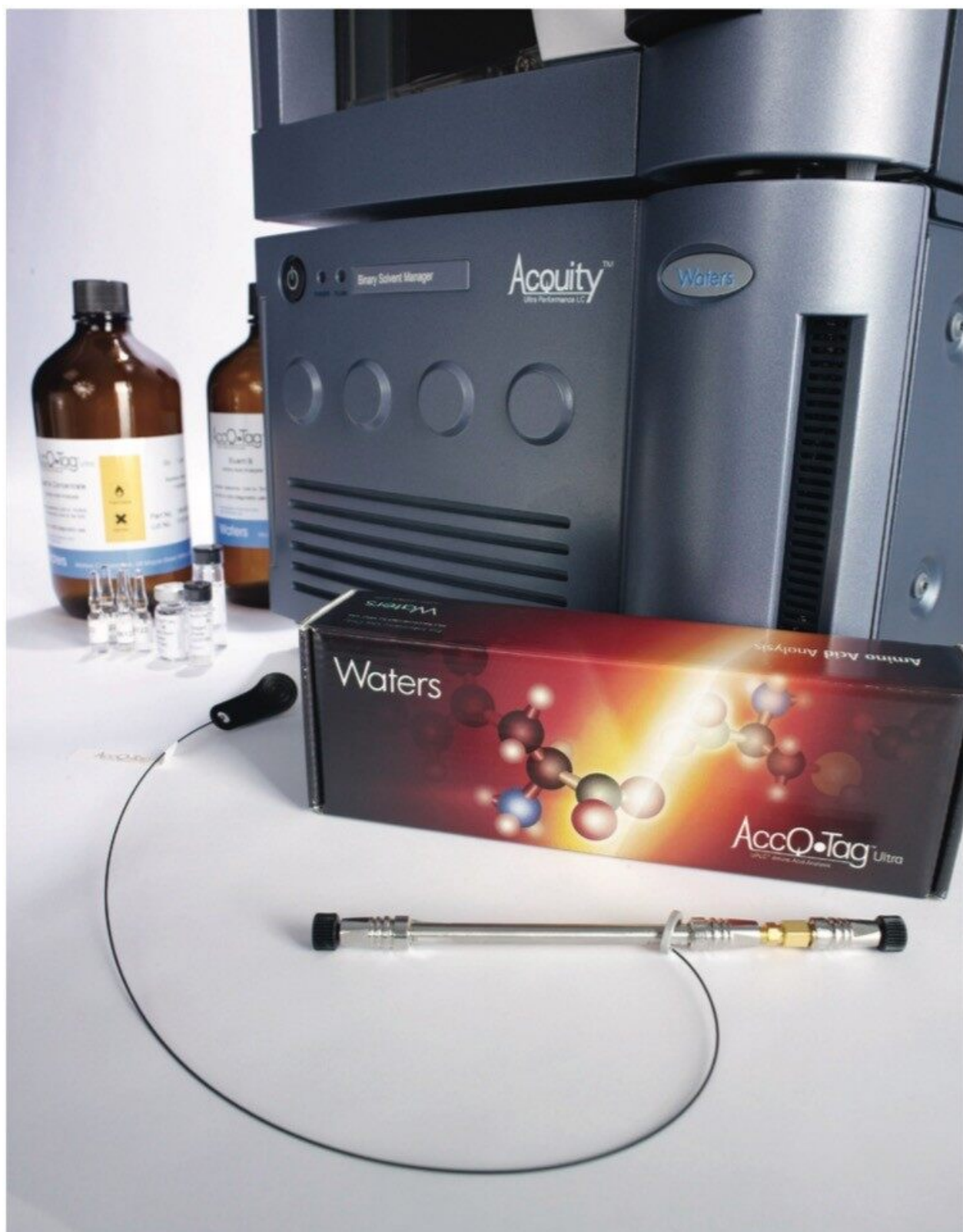
Figure 1. Waters UPLC Amino Acid Analysis Solution.