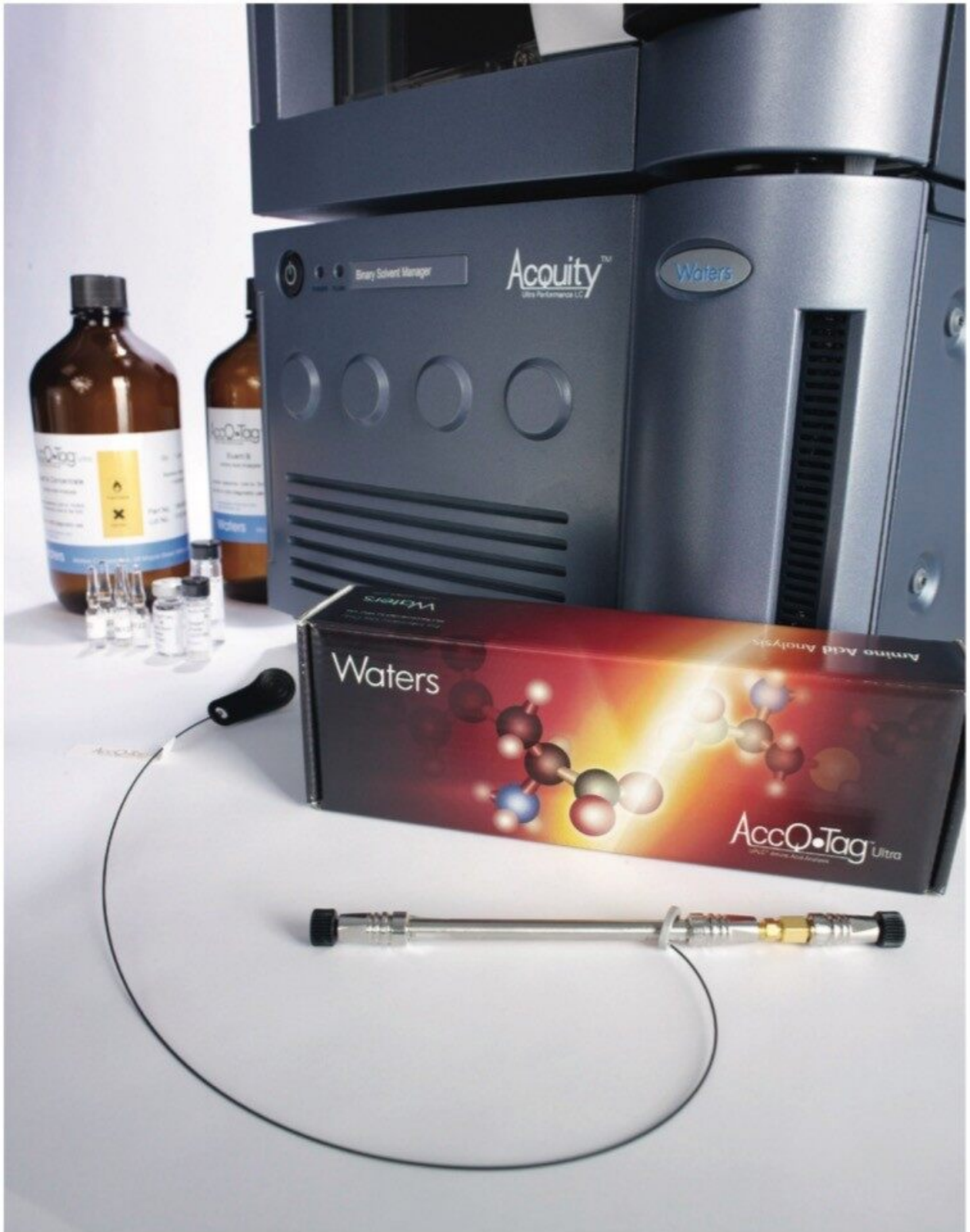
Figure 1. Waters UPLC Amino Acid Analysis Solution.