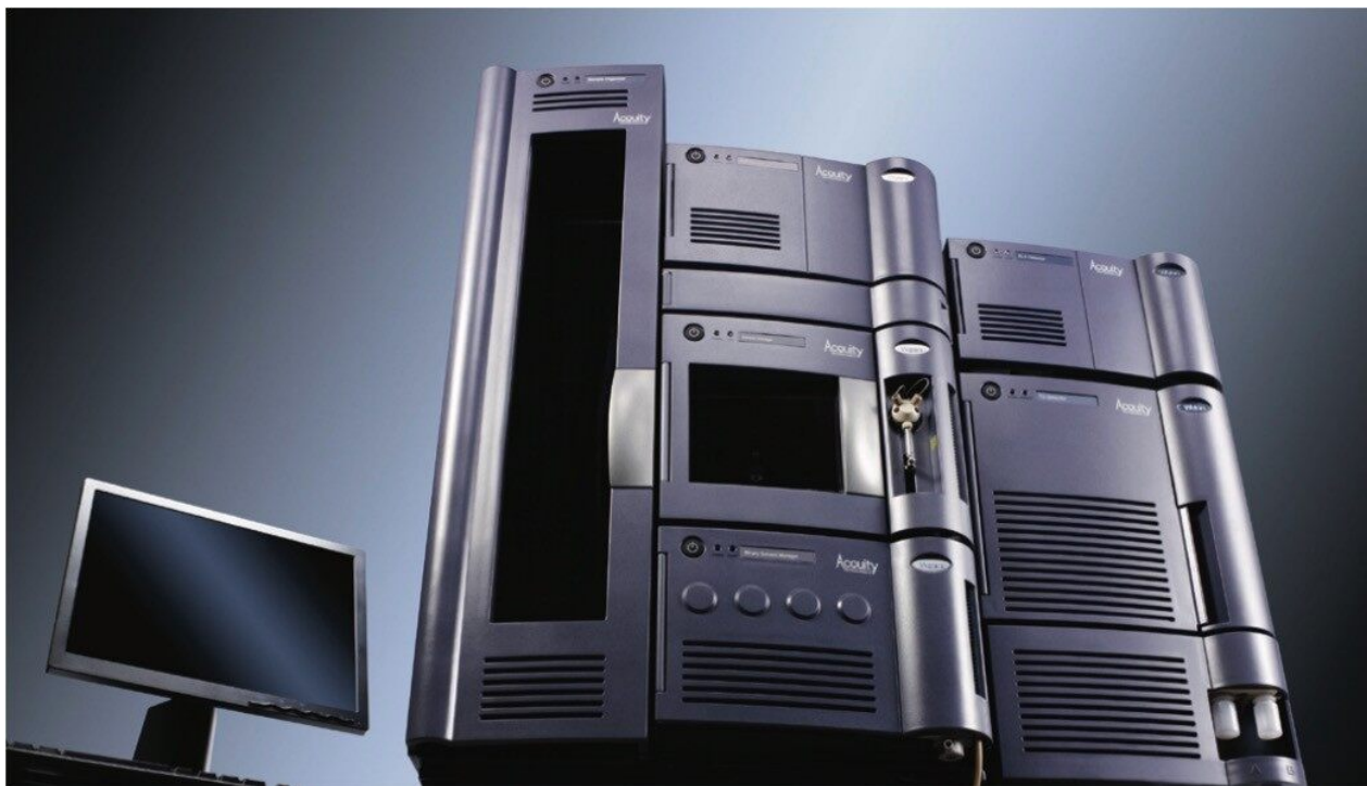
Figure 1. ACQUITY TQD System.