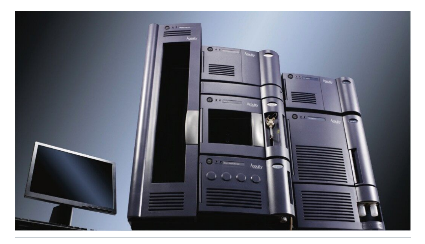
Figure 1. ACQUITY TQD System.