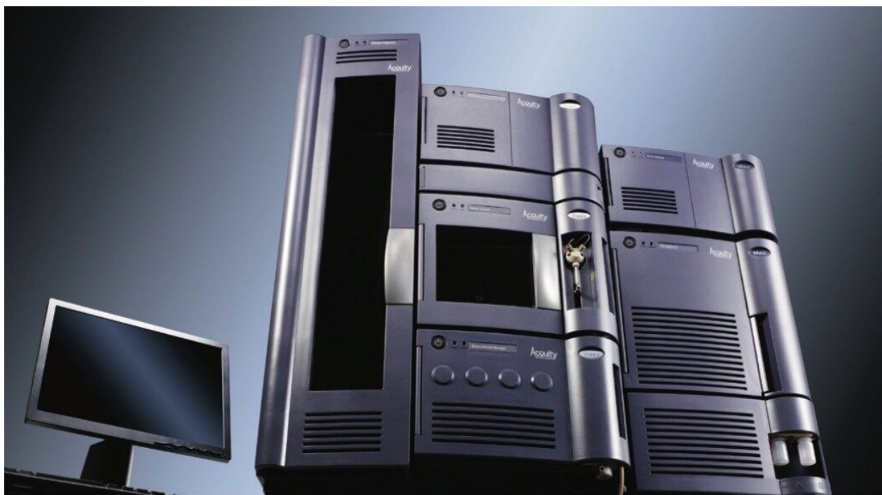
Figure 1. ACQUITY TQD System.