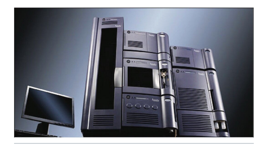
Figure 1. ACQUITY TQD System.