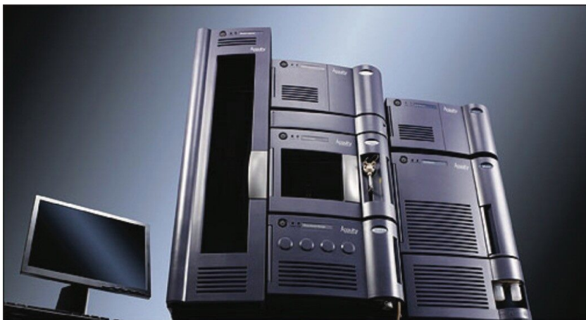
Figure 1. ACQUITY TQD System.