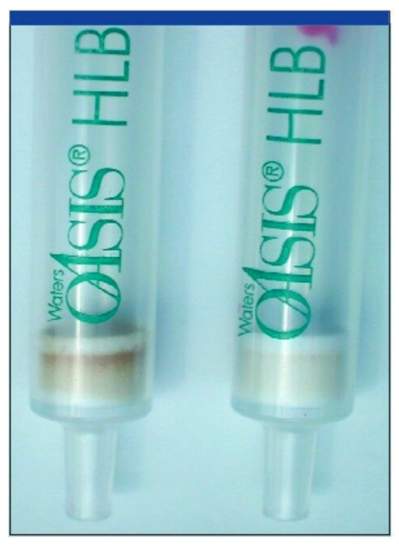
Figure 3. Left-side column (SPE Step 1): The column on the left shows the retained matrix resulting from the