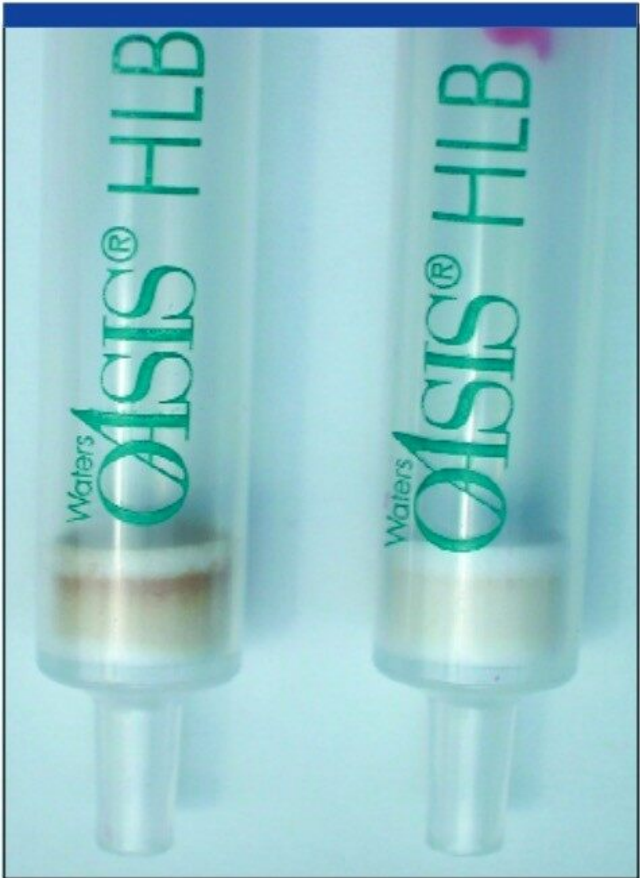
Figure 3. Left-side column (SPE Step 1): The column on the left shows the retained matrix resulting from the