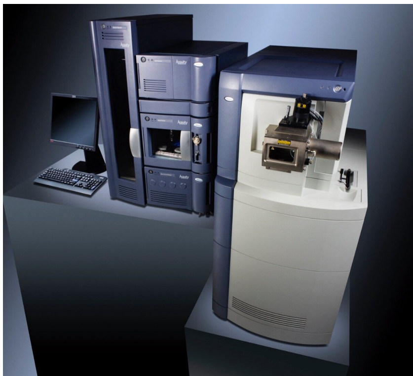
Figure 1. The ACQUITY UPLC system with the Q-ToF Premier for metabolite ID.