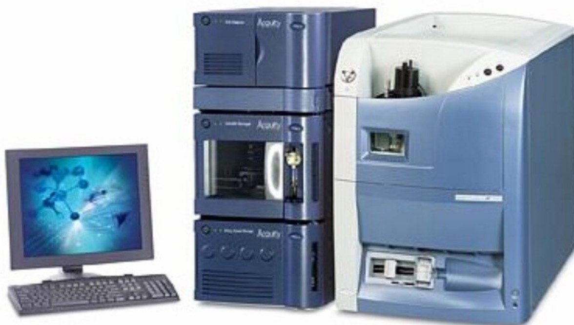
Waters ACQUITY UPLC System with the Waters Quattro Premier XE Mass Spectrometer.