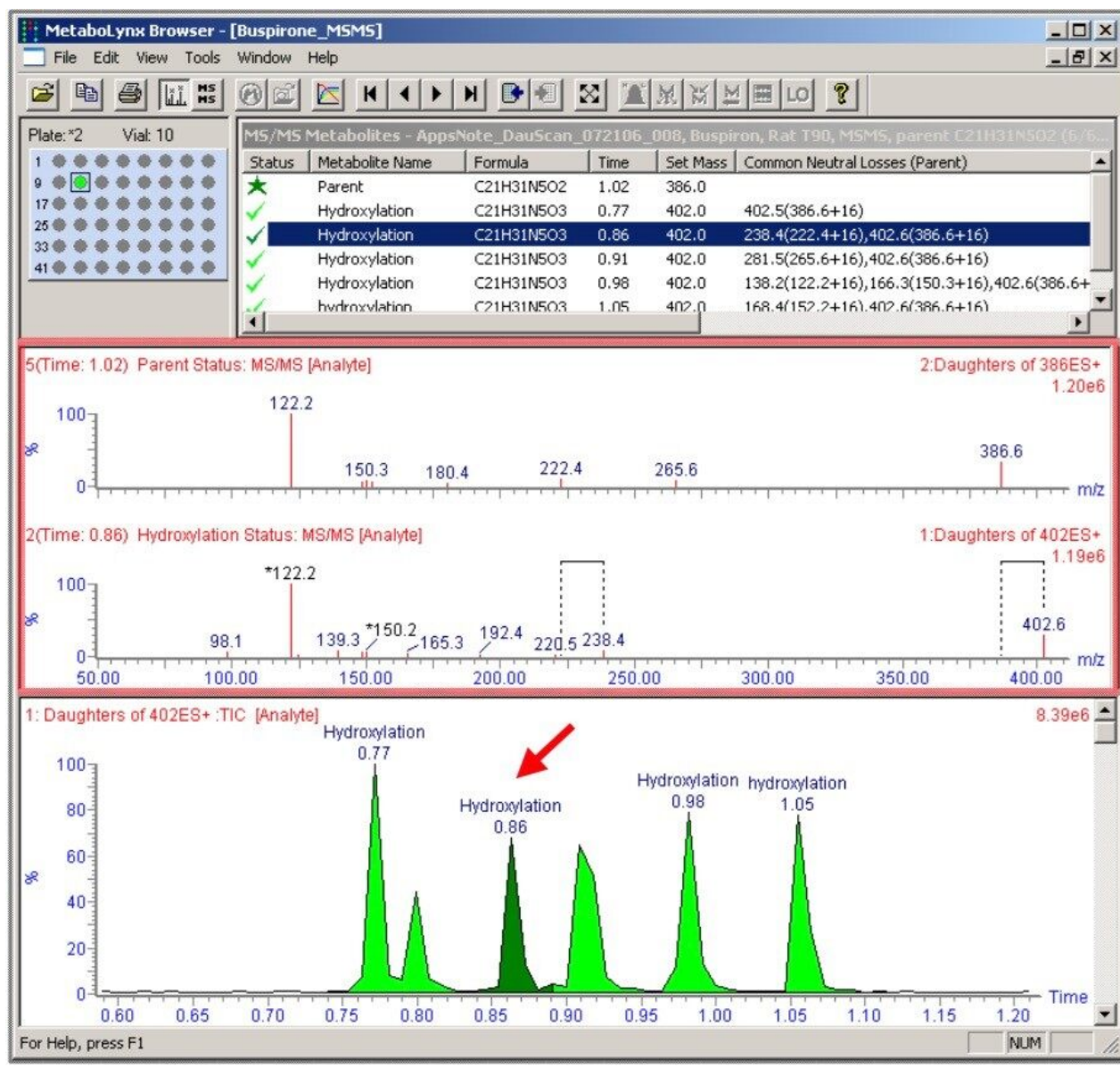
Figure 3. MetaboLynx MS/MS report for selected hydroxylated metabolites of Buspirone.

For the hydroxylated metabolite, the m/z 238 ion was 16 Da higher than the m/z 222 ion. Previous reports showed that m/z 222 is a major fragment of the parent drug following the loss of 1-pyrimidinylpiperazine (1-PP) moiety. 4 The appearance of the m/z 238 ion indicated that for this metabolite, the hydroxylation did not affect the 1-PP moiety.