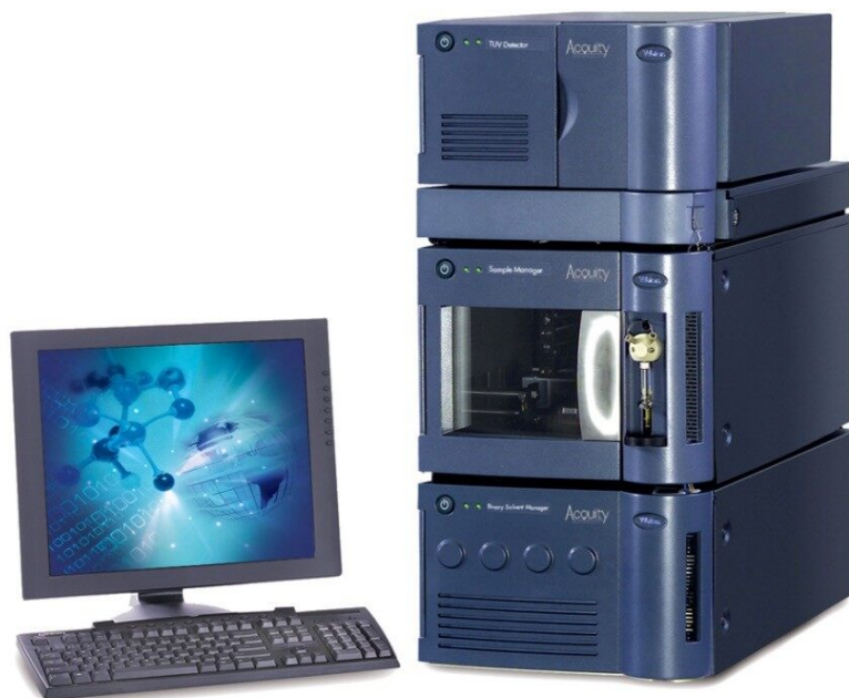
Waters ACQUITY UPLC System with the ACQUITY UPLC Column Heater/Cooler.

To maximize resolution, a second experiment was conducted. ACQUITY UPLC BEH C 18 2.1 x 150 mm, 1.7 µm Columns were linked, in series, to form 300 mm and 450 mm packed bed lengths in order to exploit the extended temperature range capabilities of the ACQUITY UPLC Column Heater/Cooler-equipped system. Each series of columns was run close to its optimal linear velocity. The neutral test probes mixture, as listed above, was also used for this experiment.