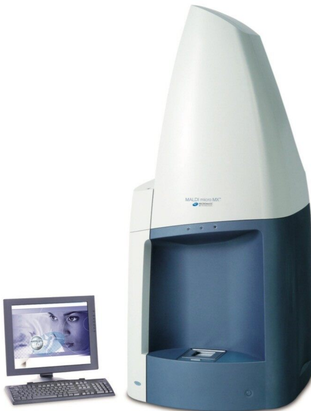
The Waters MALDI micro MX Mass Spectrometer with PSD MX Technology.